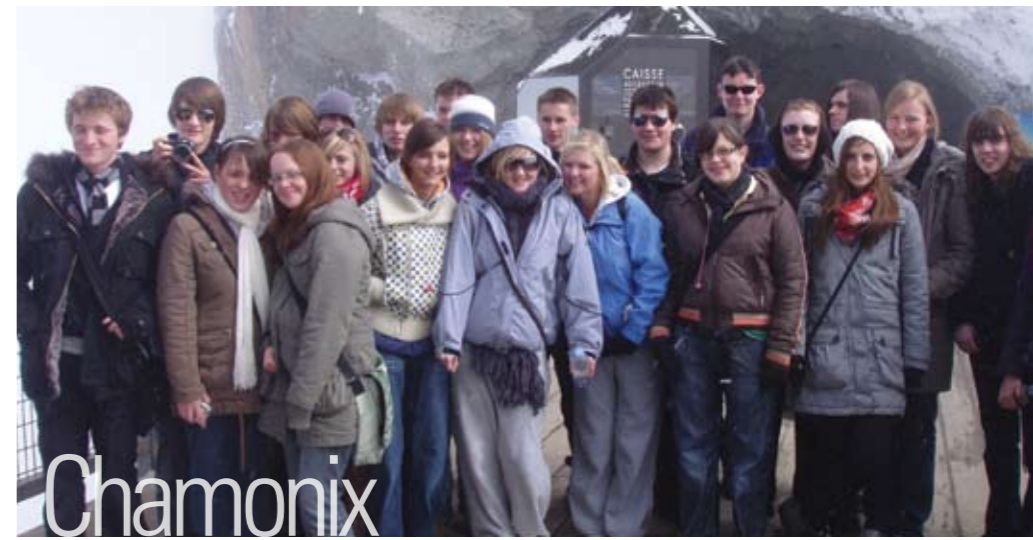
On top of the Aiguille Du Midi by cable car. Geography and Geology students study the effects of glaciation in the French Alps