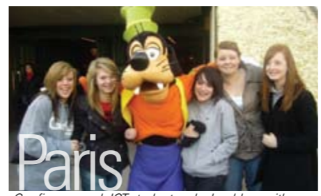
Goofing around. ICT students rub shoulders with some big Hollywood names in Disneyland Paris