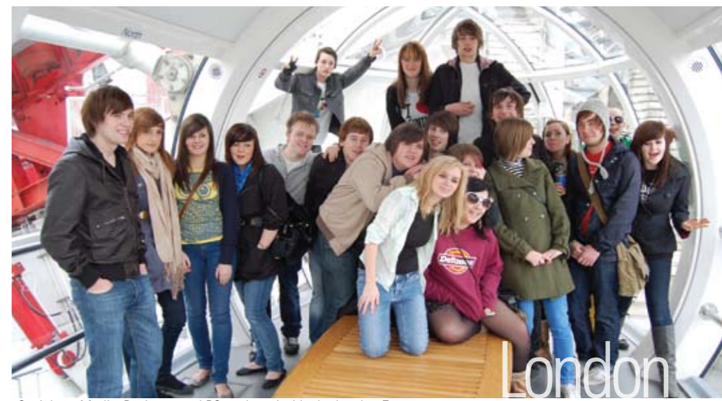
Sociology, Media, Business, and RS students inside the London Eye