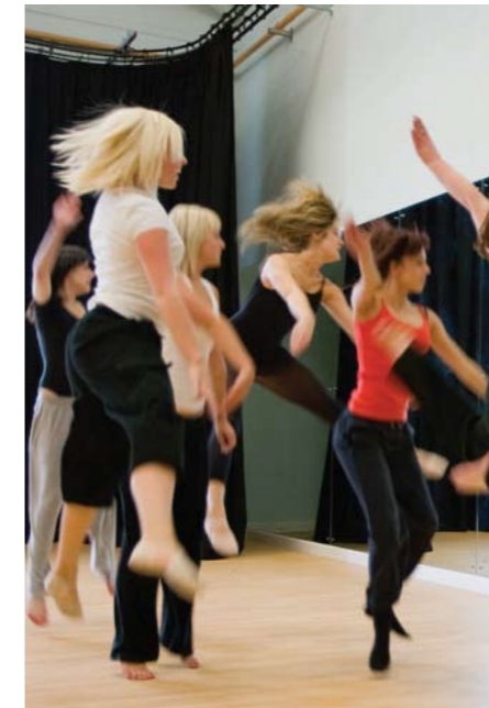
A level dance students reach for the stars