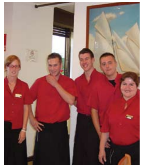
Travel, Geography and Spanish students take advantage of the opportunity to work in the hotels of Santa Susanna, Spain during the summer