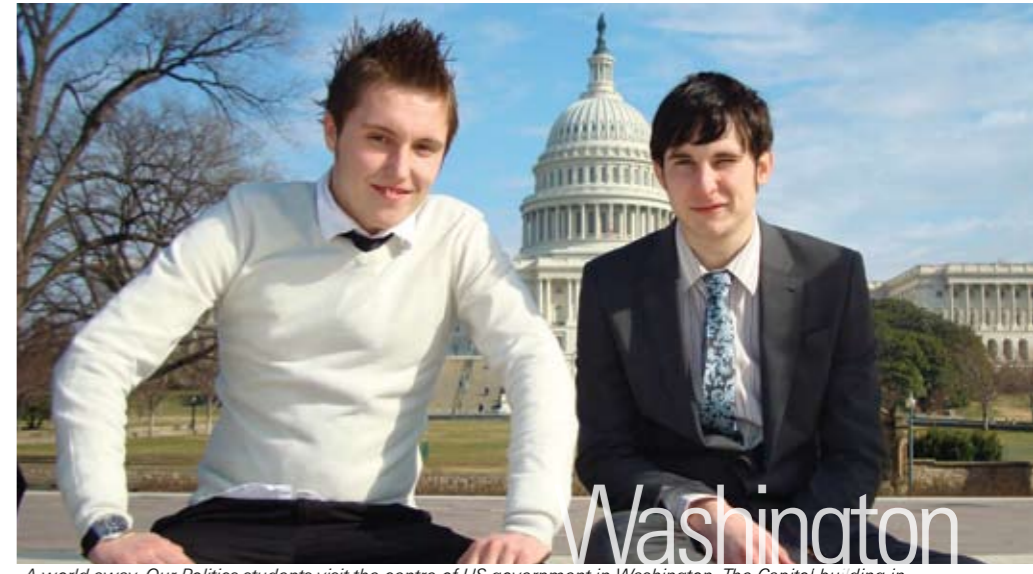
A world away. Our Politics students visit the centre of US government in Washington. The Capitol building in the background.