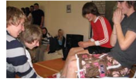
Putting on a brave face: students raise money for Children in Need