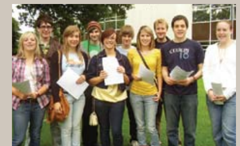
Some of the many students who achieved straight A's

Best A-Level Results Ever Overall Pass Rate 98.3%