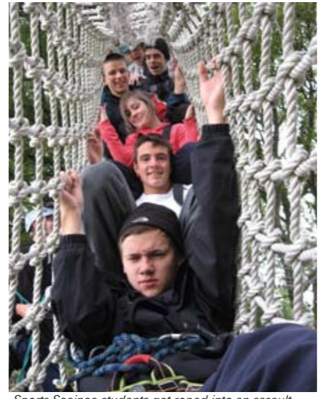
Sports Science students get roped into an assault course on their residential activity week at Askrigg.