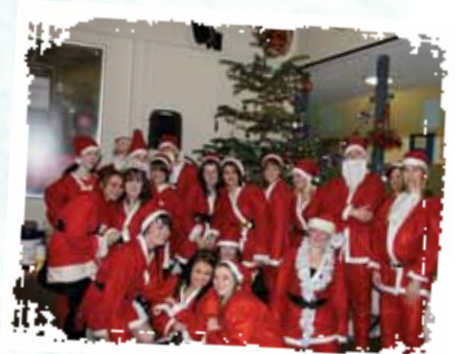
'Santa's little helpers' raised £350 for Daisy Chain, a charity which offers respite care and other support for families and children with autism.