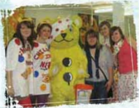
Pudsey Bear dropped into College to help students raise £980 for Children in Need.