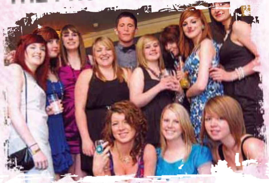
Second year students let their hair down at a leavers' party at Hardwick Hall. As well as dancing, the students could try their hand at roulette and blackjack at the fun casino.