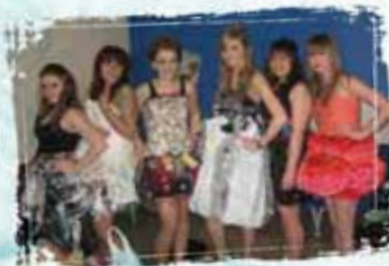
Following humanitarian crises in Gaza and Sri Lanka, some students were moved to organise a fundraising fashion show which raised over £750.