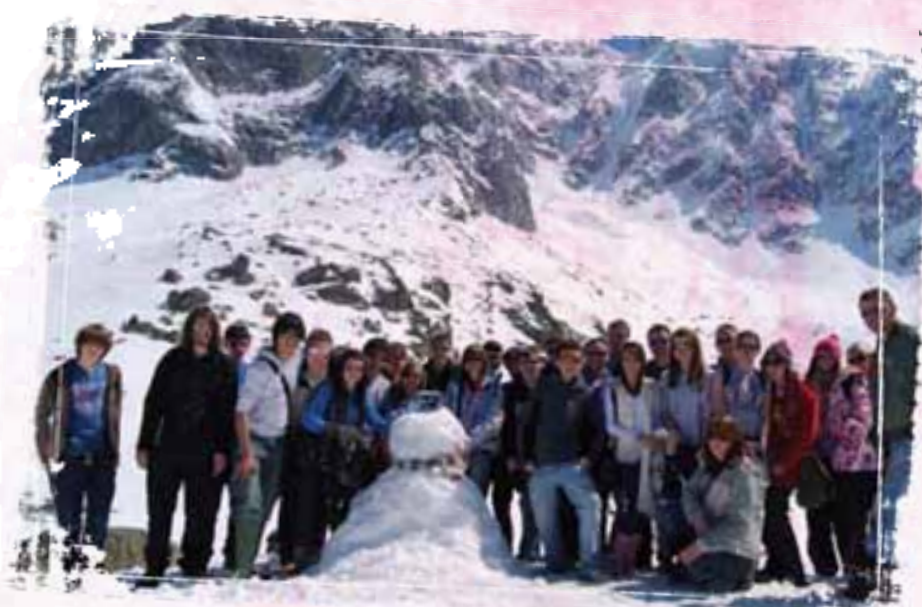
Geography and Geology students found time to make a snowman while studying the effects of glaciation in the French Alps.