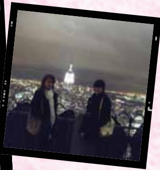
Geography, Art and Travel and Tourism students survey the Manhattan in skyline.