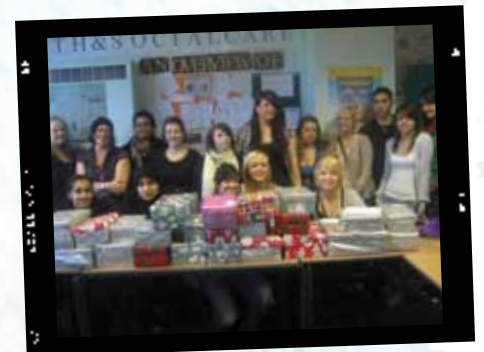
Boxing clever – 30 shoe boxes full of goodies collected by students sent to needy children in Eastern Europe.