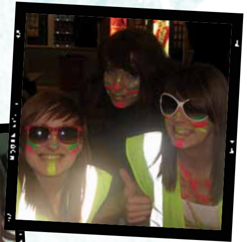
Students laughed their way to a total of £550 raised for good causes.