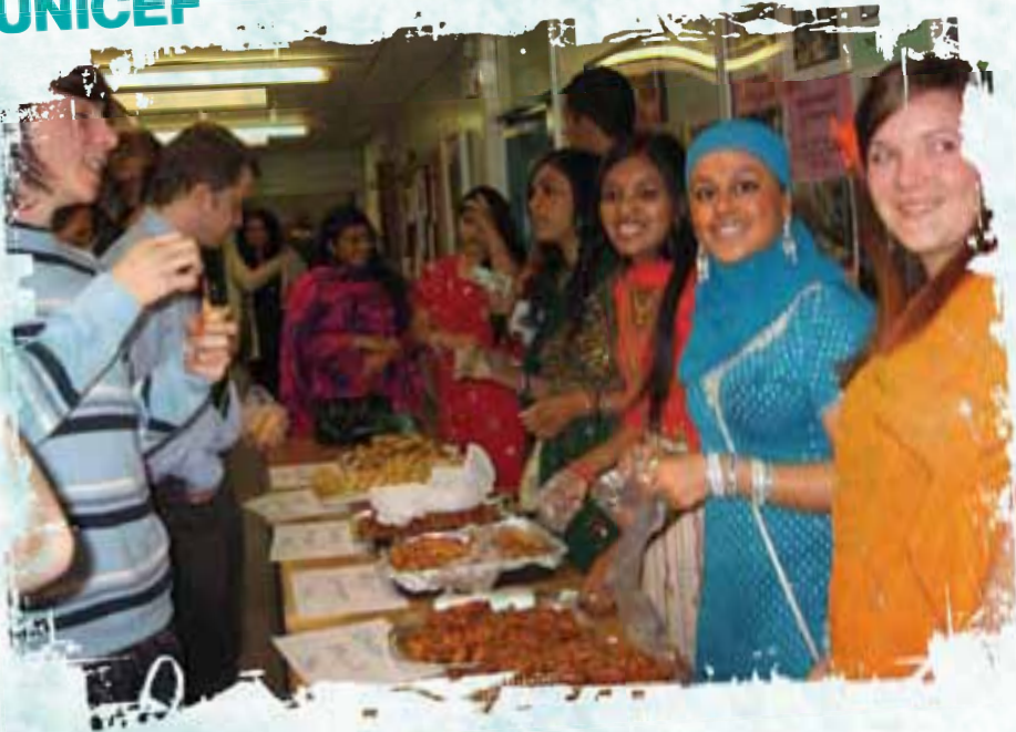
Our Asian students spearheaded a fundraiser which raised enough money for 800 children in the Third World to be immunised against 5 killer diseases.